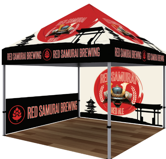
Angle View w/ Backwall & Half Side Wall