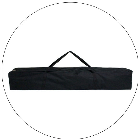
(QTY 1): Black Nylon Carry Bag