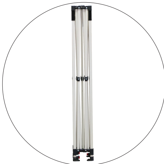
(QTY 1): Frame